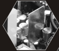
High Quality 105°C Cap