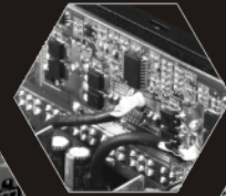
Patented DC connector Module