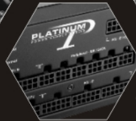
Full Modular Cabling